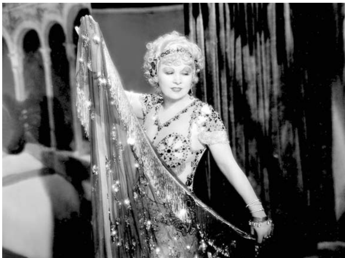
This image released by PBS shows Mae West in a scene from the 1933 film "I'm No Angel."

It's a remarkable life: Despite having only a third grade education, West wrote her own plays and screenplays and rarely delegated any detail. She launched Cary Grant's career, was sentenced to prison and became the second highest paid person in the entire country, behind only William Randolph Hearst.